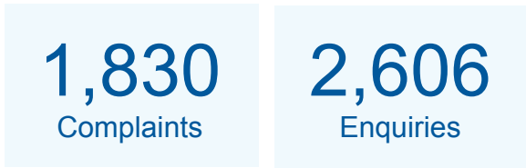
TABLE 1 Classification of complaints